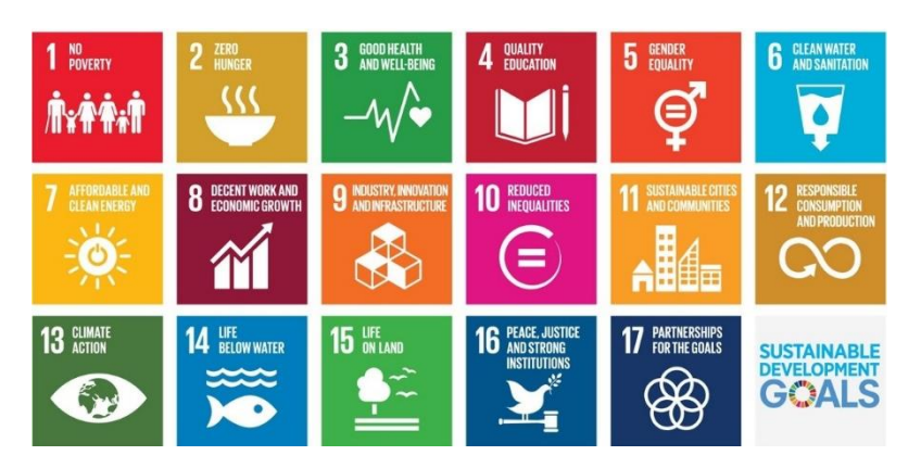
Figure 1: The Global Sustainable Development Goals (SDGs)

policy strategy, nor to reject it in general. Rather, a socio-ecological transformation of the economy and society is necessary.