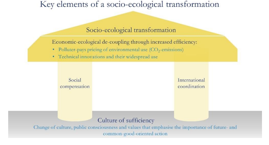
Figure 2: Guidelines of a socio-ecological transformation of the economy and society

1. Rapid introduction of comprehensive structural reforms to decouple growth and resource use. Central to this is a fair pricing of environmental use so that the social and ecological costs caused by production and consumption are not passed on to third parties, especially to the socially weaker and future generations ("externalisation of costs"). This also creates effective incentives for technical innovations, strengthens competition between suppliers as well as transparency and freedom of choice for consumers.