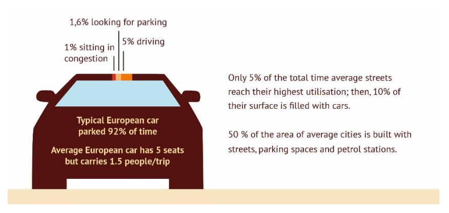
Figure 4: Actual time of use of average cars and roads in Europe (Own representation based on Circular Economy Report 2015)<sup>17</sup>

As an example of the complex field of action of the shift in consumption and mobility, the motorised private transport, which is essential for many national economies and societies, will be picked out here. If we consider, for example, that cars in Europe on average remain unused 92% of the time, the use of resources and the environmental impact of production are grossly disproportionate to the mobility benefits they generate (cf. Fig. 4). If cars were produced in such a way that all resources used could be recycled to a large extent (circular economy) or if there were suitable service offerings and sharing models ("use instead of own"18) so that every car would be used by as many people as possible, the ratio of environmental impact and mobility benefits would already improve significantly. It would be even more sustainable if unnecessary traffic were avoided and the mobility benefits were generated by other modes of transport. This would also significantly reduce use-related energy consumption, environmentally harmful emissions, health hazards 19 (especially through lack of exercise and accident-related personal injuries) and the occupation of public space by moving as well as parked cars.